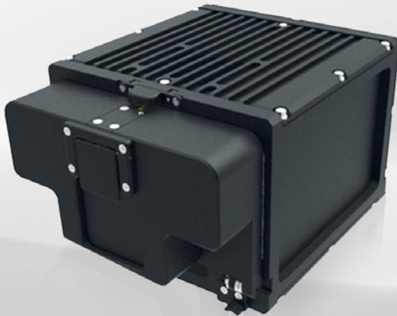
SECURE DATA RECORDER (SDR)