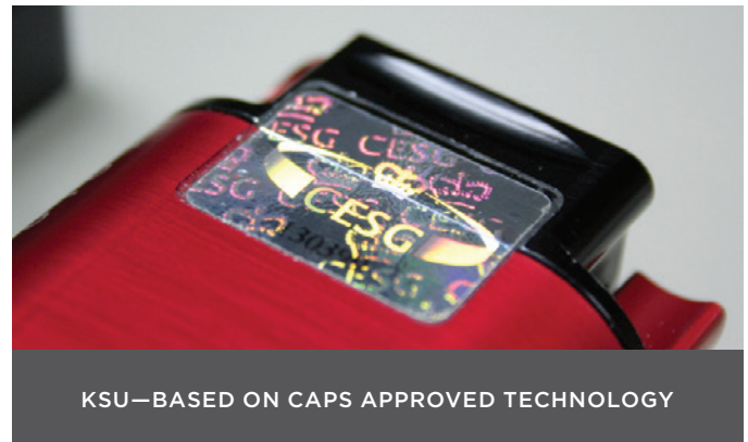
K5U—BASED ON CAPS APPROVED TECHNOLOGY

The SDR is based on the certified Viasat Eclipt ® 600 encrypted hard drive and has been adapted for harsh operating environments in the air, land, and sea domains. This technology is field-proven on the UK Future Lynx Wildcat helicopter program. The SDR provides a low-risk approach, leveraging existing certified Viasat encryption and flexible data interface options with large storage capacity. As a result, all data generated during deployment is protected.