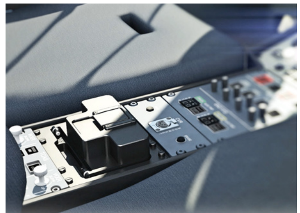
SIMPLE INTEGRATION—COCKPIT EXAMPLE

Viasat's Eclipt technology integrates accredited authentication with entire disk encryption techniques and data storage, in tamper-resistant internal or portable hardware, to safeguard your data. This provides instant data protection without noticeable adverse effects on computer performance.