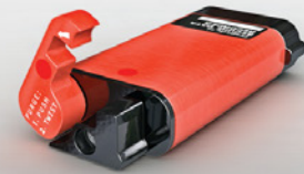
KEY STORAGE UNIT (KSU)

BASED ON VIASAT'S ACCREDITED ECLYPT® TECHNOLOGY