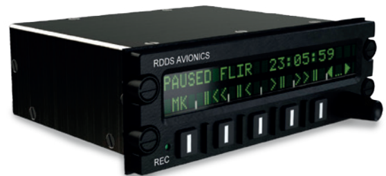
GSS CONTROL PANEL

All data is stored using industry-standard formats such as JPEG and MPEG. For greater exploitation and debrief capability, the GSS offers mission data loading, encryption key loading, multi-channel concurrent playback, metadata extraction, and fast-forward/rewind to markers.