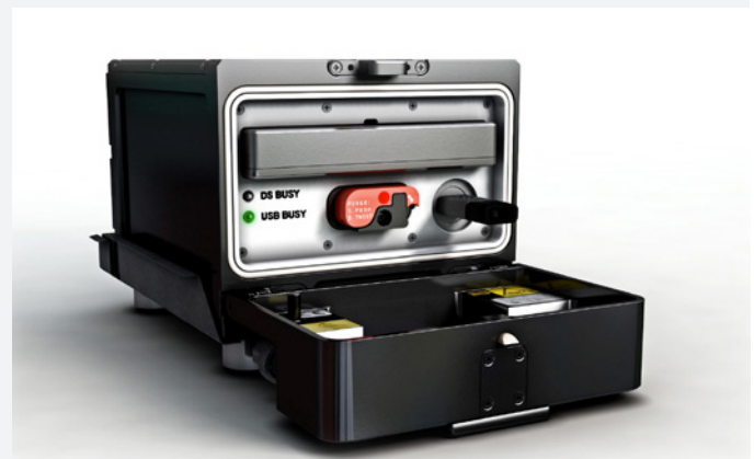
SDR WITH ACCESS PANEL OPEN, REVEALING THE KSU AND SDS