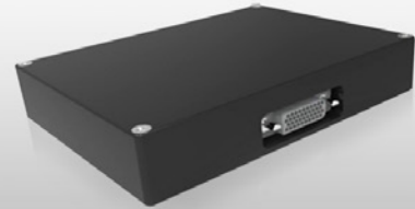
SECURE DATA STORE (SDS)