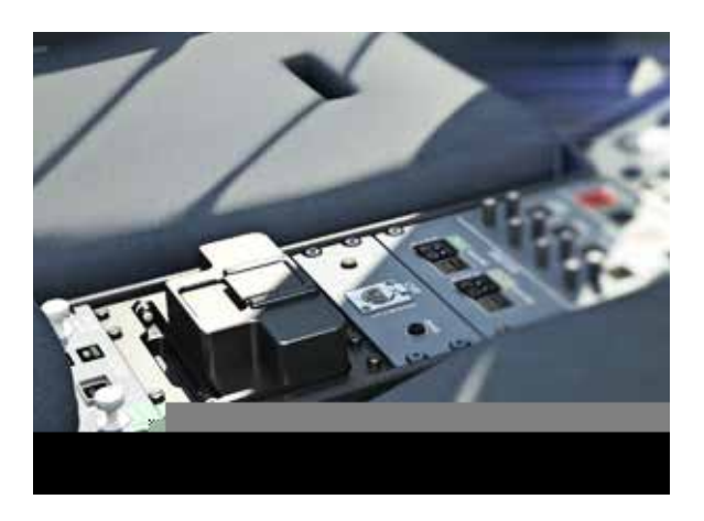
SIMPLE INTEGRATION—COCKPIT EXAMPLE

Viasat's Eclypt technology integrates accredited authentication with entire disk encryption techniques and data storage, in tamper-resistant internal or portable hardware, to safeguard your data. This provides instant data protection without noticeable adverse effects on computer performance.