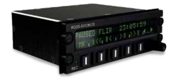
GSS CONTROL PANEL

All data is stored using industry-standard formats such as JPEG and MPEG. For greater exploitation and debrief capability, the GSS offers mission data loading, encryption key loading, multi-channel concurrent playback, metadata extraction, and fast-forward/rewind to markers.