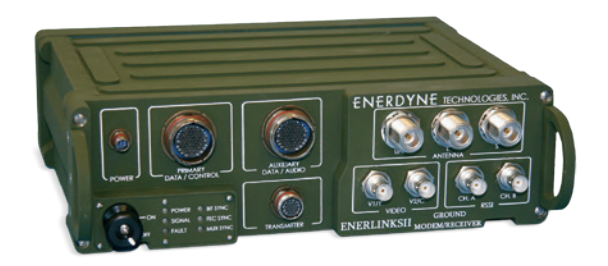
ENERLINKSII GROUND MODEM/RECEIVER

Conversion from an analog to a digital ISR data link has always required significant systems re-engineering of the airborne platform. The Viasat EnerLinksII DVA system substantially eliminates UAV re-engineering and provides all the benefits of digital processing. It includes IP sensor data, metadata, standardized video compression, extended-range performance, bandwidth and spectrum utilization, and now includes AES-256 encryption. Analog bypass modes allow complete interoperability with predecessor analog systems enabling a painless, gradually phased upgrade program.