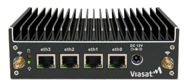
Figure 3: Rear View