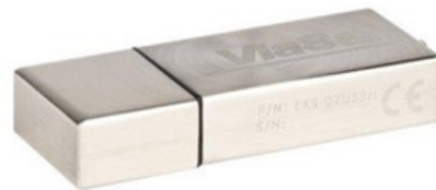
Viasat Key Stone (required for two-factor authentication)

*Installation compatible with tested Windows/Linux operating systems and compatible COTS laptops.