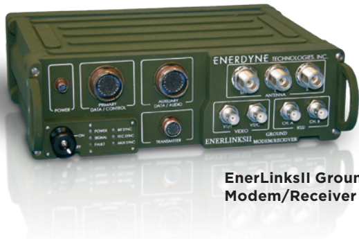
EnerLinksII Ground Modem/Receiver

Conversion from an analog to a digital ISR data link has always required significant systems re-engineering of the airborne platform. The EnerLinksII DVA system substantially eliminates UAV re-engineering and provides all the benefits of digital processing. It includes IP sensor data, metadata, standardized video compression, extended-range performance, bandwidth and spectrum utilization, and now includes AES-256 encryption. Analog bypass modes allow complete interoperability with predecessor analog systems enabling a painless, gradually phased upgrade program.