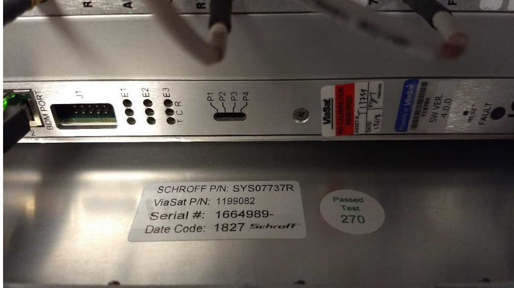
Figure 5. Schroff Chassis Label