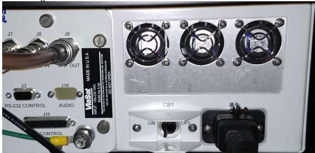
Figure 4. Behlman PSU