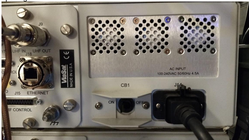
Figure 6. XP Power PSU