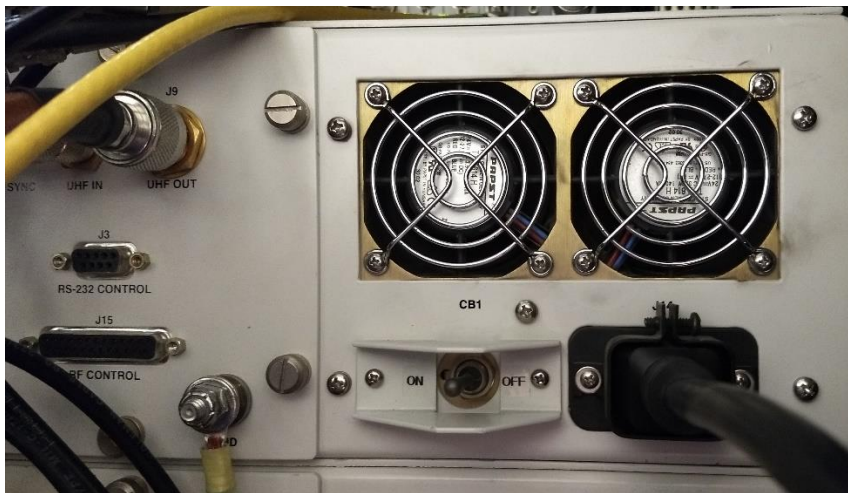
Figure 2. ATC PSU