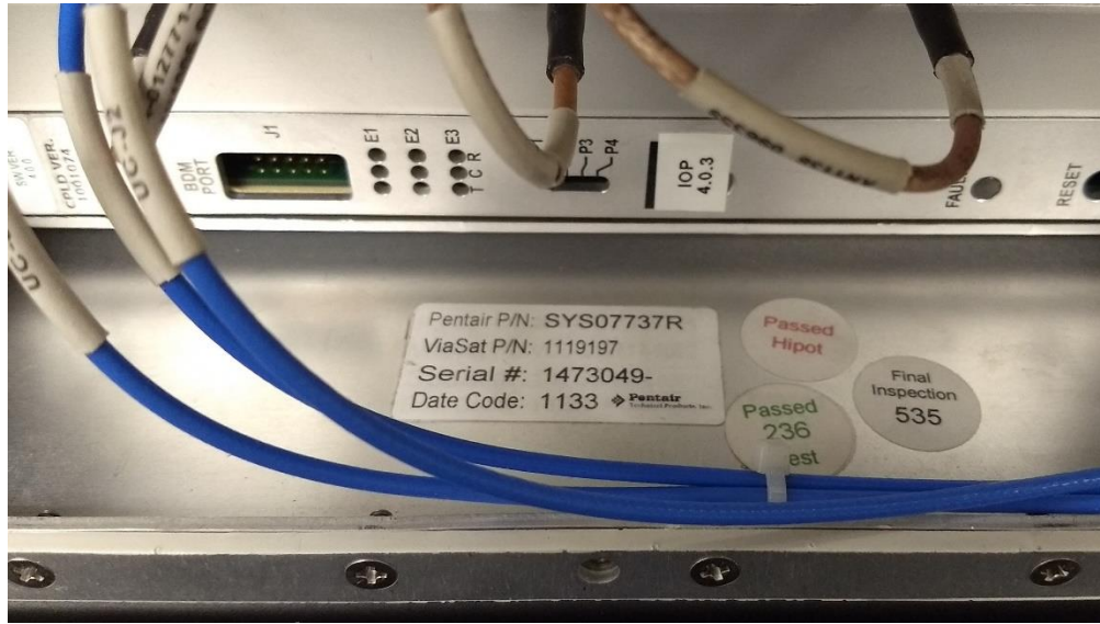
Figure 3. Pentair Chassis Label