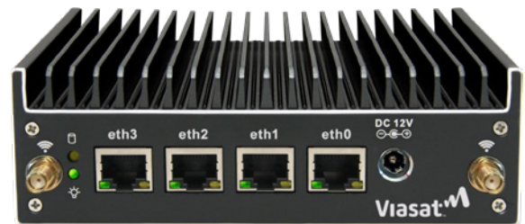
Figure 3: Rear View